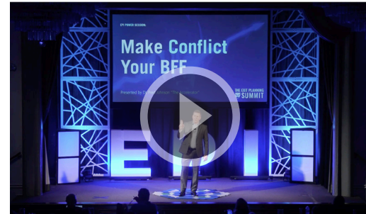
EPI - Make Conflict Your BFF

If your organization is seeking an impact speaker, Call our office or email us at: