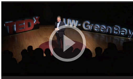
TEDx - I am Enough