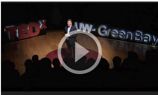
TEDx - I am Enough