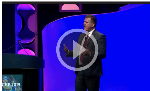
ACRP - Leading Change