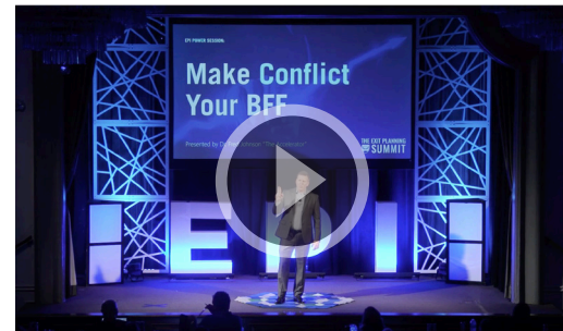
EPI - Make Conflict Your BFF

If your organization is seeking an impact speaker, Call our office or email us at: